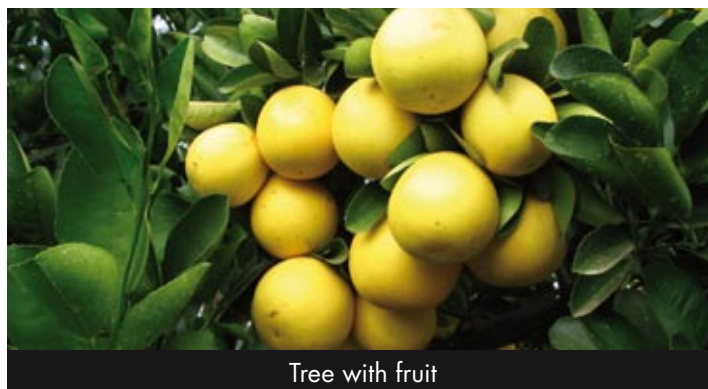
Tree with fruit